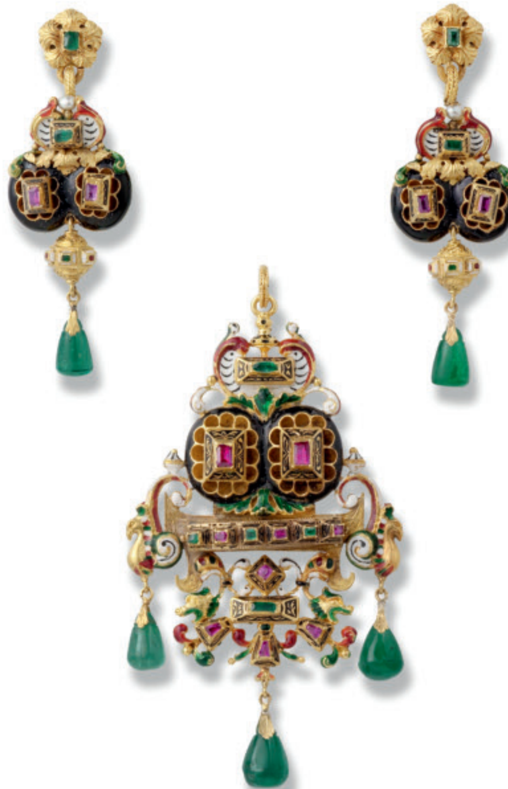
A gold and gem-set demi-parure in the Renaissance taste by Castellani composed of a pendant and earrings decorated with black and white enamel set with table cut emeralds and rubies, suspended with emerald drops. Rome, c.1860. Total height of pendant: 8.5cm.