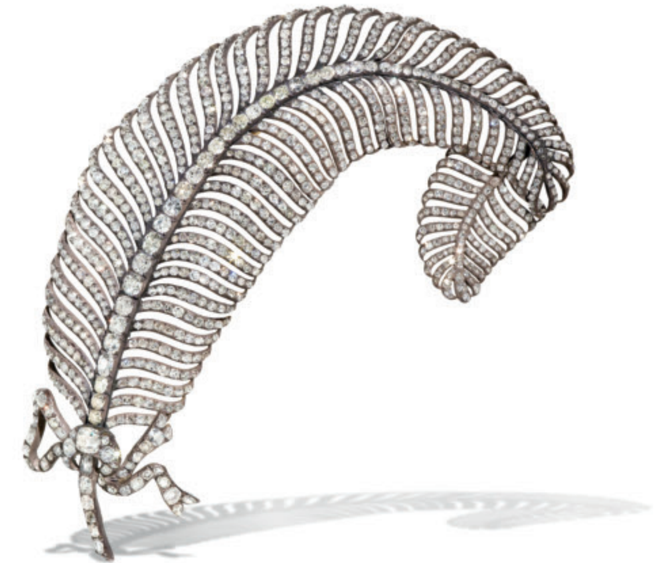
A monumental diamond set diadem converted as a brooch, composed as a feather tied with a bow in the style of Marie-Antoinette, mounted on gold and set in silver. It appears in the Cartier archives. c.1900. Shown life size.