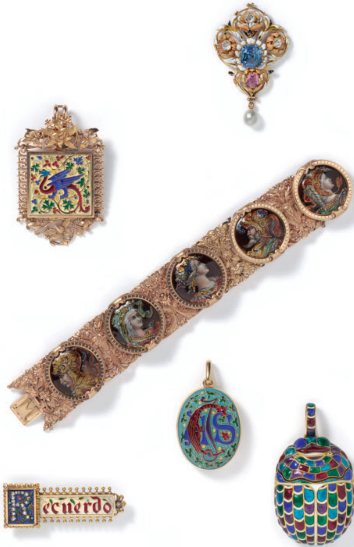
Jewellery by Lucien Falize in the Egyptian, Medieval and Renaissance taste. Paris, 1878-95. Height of scarab: 6.2cm.