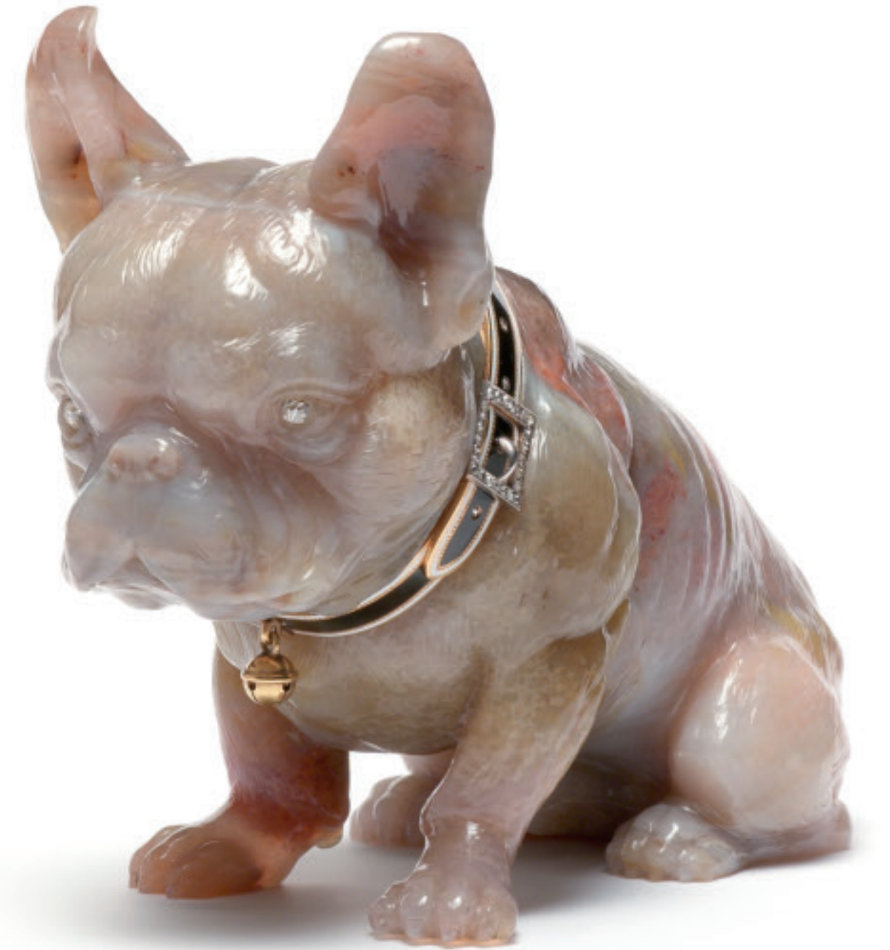
A large study of a bulldog by Fabergé carved from petrified wood, its enamelled gold collar fastened with a diamond set buckle. Acquired from Fabergé's London branch on 21st November 1916 for £90. Maximum height: 8.8 cm.