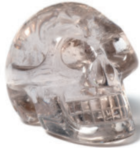
A rock crystal memento mori in the form of a grinning skull. Spanish, seventeenth century. Height: 3.8 cm.