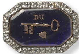
18th century German brooch, 'You Hold the Key to My Heart'. £1,175