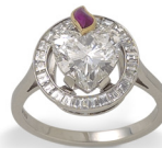
A 'Heart on Fire' ring. £13,800