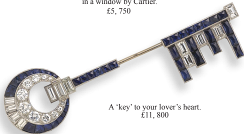
A 'key' to your lover's heart. £11,800