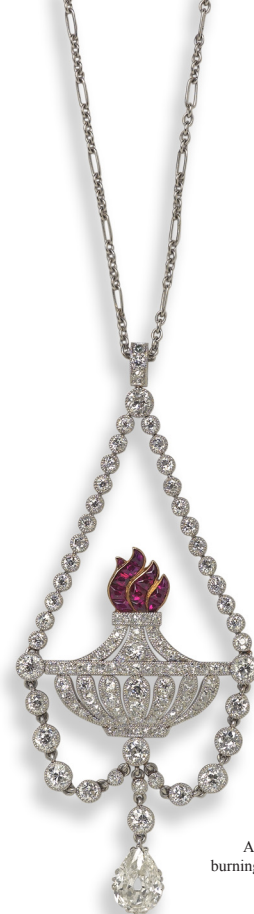
A torch of love, burning with ruby flames. £25,000