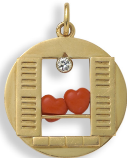
Pendant with two hearts joined in a window by Cartier. £5,750