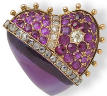
A pierced heart brooch. £10,000