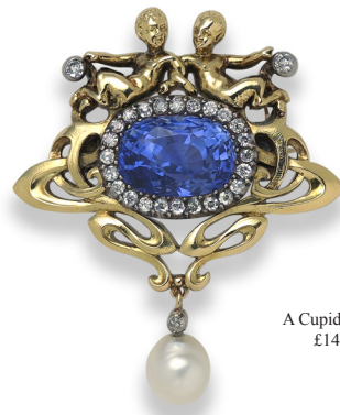
A Cupids brooch. £14,000